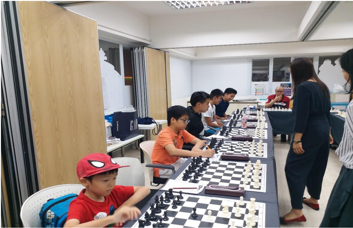
The children are all engaged in the activity